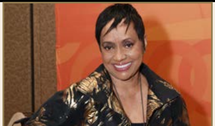
Judge Glenda Hatchett (Stewart Miller Simons Trial Lawyers)

CRISIS MANAGEMENT: HOW TO BUILD AN EFFECTIVE STRATEGY