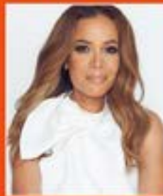
SUNNY HOSTIN 5 X EMMY AWARD WINNING LEGAL JOURNALIST