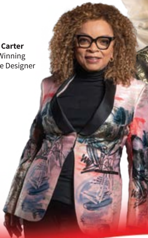
Ruth E. Carter Award-Winning Costume Designer