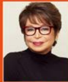
VALERIE JARRETT CEO, THE BARACK OBAMA FOUNDATION