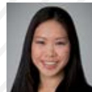
Mei Dan Private Equity Silicon Valley