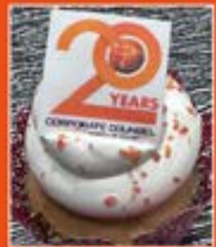
20 YEAR ANNIVERSARY 20 YEARS OF TRANSFORMING THE LEGAL INDUSTRY