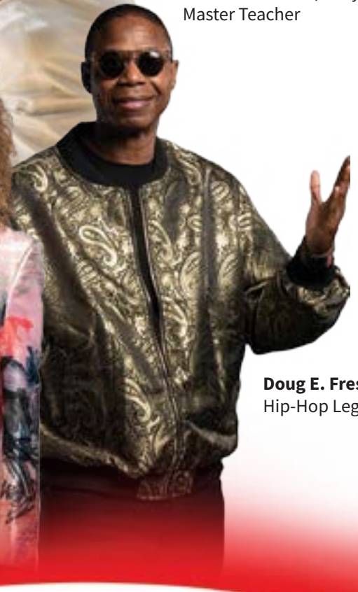
Doug E. Fresh Hip-Hop Legend