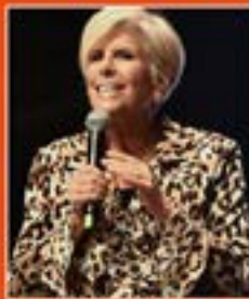
SUZE ORMAN FINANCIAL EXPERT