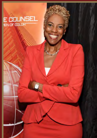
5 Strategies on How to Use Culture to Impact Leadership