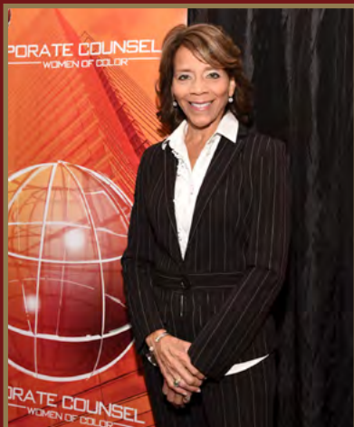
Under New Management—Risking New Leadership...Being the Boss of Your Life