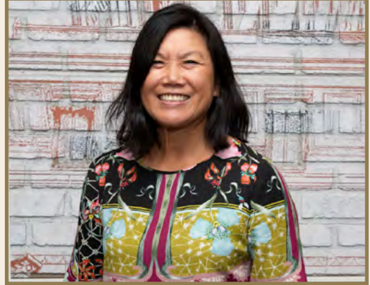
Jan Kang (Chronicle LLC)

LAW DEPARTMENT METRICS: KEY WAYS TO MARKET YOUR AND YOUR DEPARTMENT'S VALUE