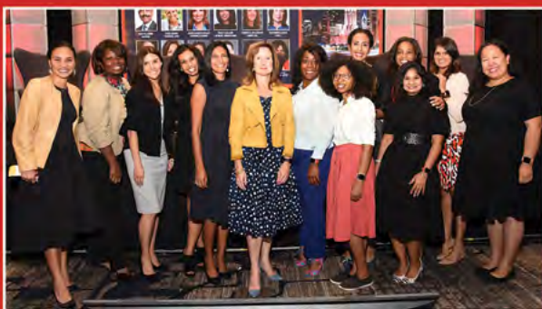
Apple In-House Legal Team