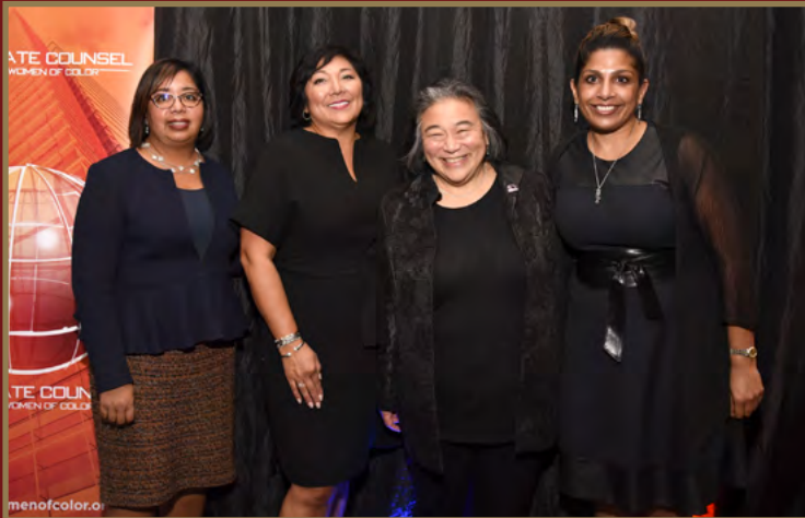
#MeToo: How to Ensure that Women of Color Have a Voice and Are Not Forgotten During the Movement