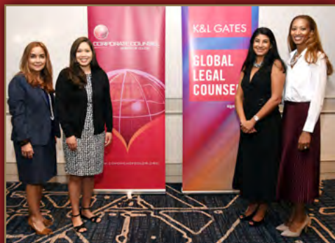
K&L Gates LLP Attendees