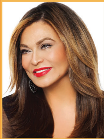
TINA KNOWLES BUSINESS WOMAN AND FASHION DESIGNER