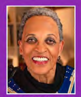
JOHNNETTA B. COLE President and Chair of the National Council of Negro Women